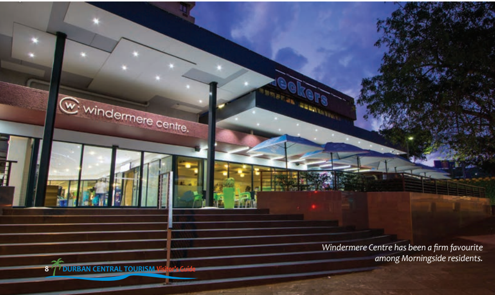
Windermere Centre has been a firm favourite among Morningside residents.

Windermere Centre has been a firm favourite among Morningside residents for many years as a meeting place and shopping destination catering for just about every need. The centre offers shoppers a mix of retailers that provide for day-to-day necessities as well as life's little luxuries. Windermere Centre underwent an extensive renovation a few years back and is very accessible, and free parking makes shopping a breeze. Several entrances and exits welcome pedestrians and the installation of a lift makes visiting multiple shops extremely convenient, with or without a trolley. There are offices situated at the centre and residential flats above the shopping mall. As a result, Windermere Centre has become a landmark in Durban and a regular meeting place for the community.