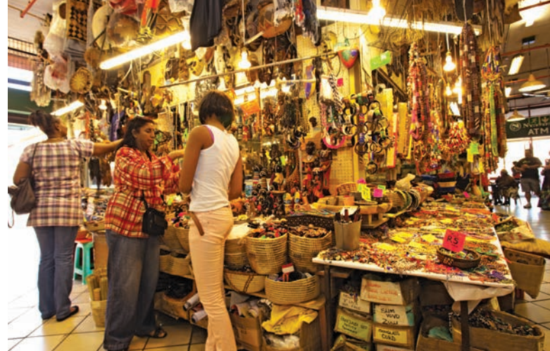
The Victoria Street Market is a sensory sensation!

Musgrave Centre offers a unique, cosmopolitan shopping experience for the discerning buyer in search of the best that is available – from decor shops to boutiques that stock the latest fashions. The elegant restaurants and cafés on all three shopping levels offer delectable refreshments as well as top quality service, and patrons can take in a movie on the upper level. One of the most attractive malls in Durban, Musgrave Centre is classy but certainly hasn't lost its intimate feel.