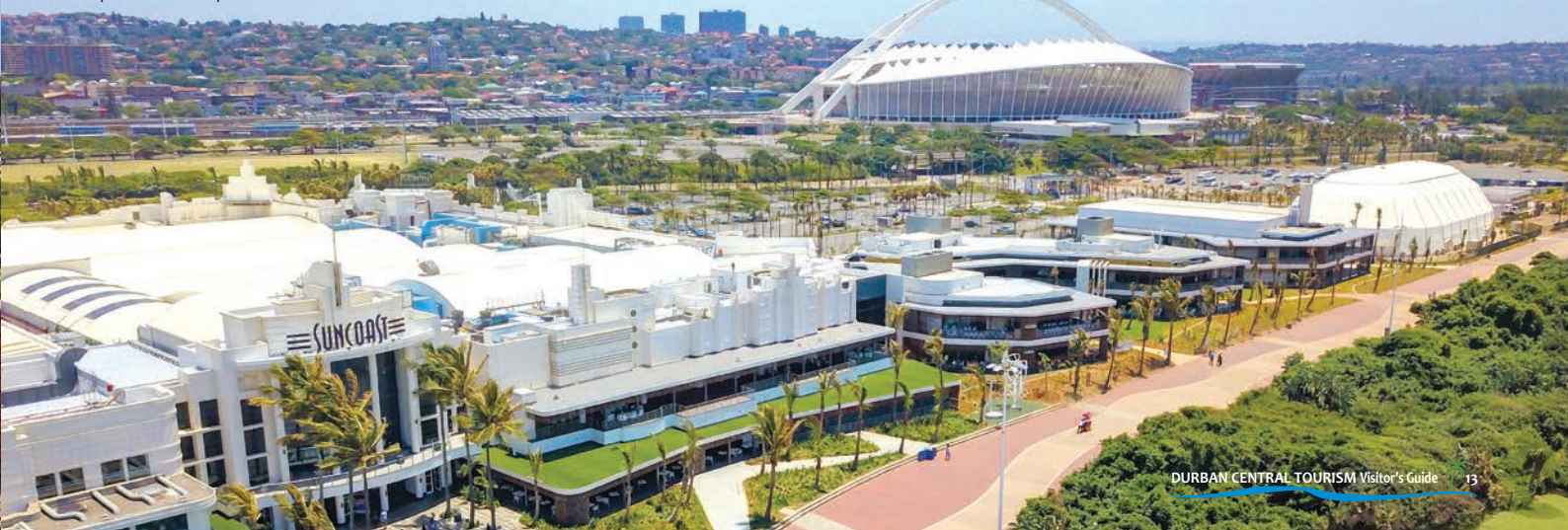
The recently expanded Suncoast Casino, Hotels and Entertainment complex is Durban's premier entertainment venue.