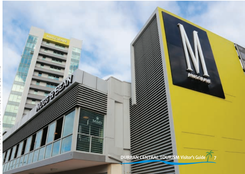
Musgrave Centre's sophisticated and modern exterior.