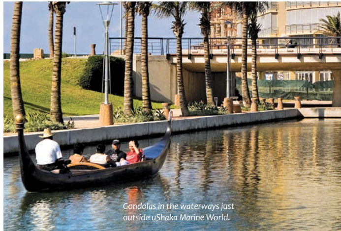
Gondolas in the waterways just outside uShaka Marine World.