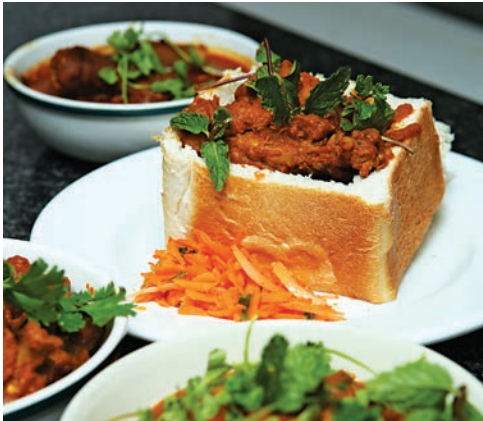
The Bunny Chow is Durban's most famous street food that is well worth a try.