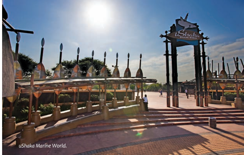
uShaka Marine World.