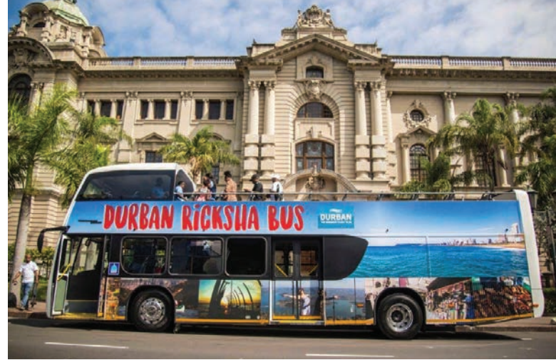
The Riksha Bus affords unique views and informative commentary on Durban's attractions.