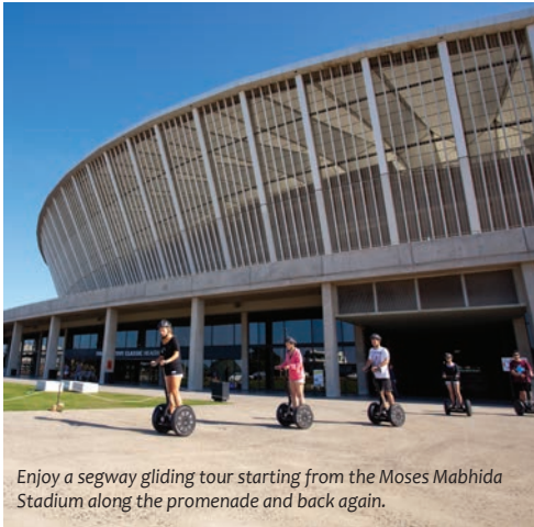
Enjoy a segway gliding tour starting from the Moses Mabhida Stadium along the promenade and back again.