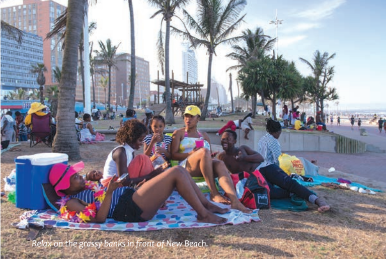
Relax on the grassy banks in front of New Beach.