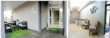
Cato Suites Hotel based in Glenwood, Durban.