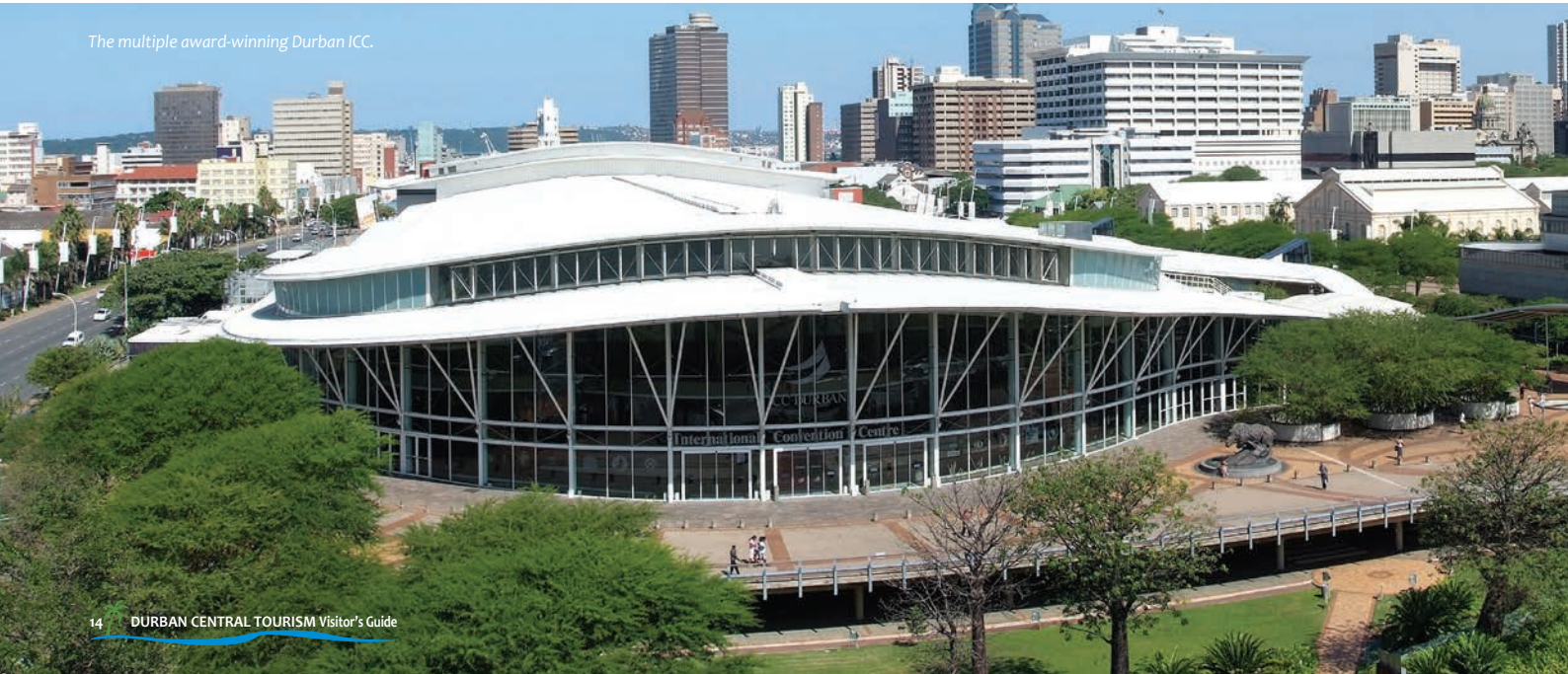
The multiple award-winning Durban ICC.

ICC is just minutes from Durban hotels and beaches. It is a purpose-built, fully air-conditioned centre with three convention halls that are interlinked but separate. Moveable walls allow for a number of different venue configurations. Alternatively, the halls can be opened up to form one large venue with seating for 5 000 delegates or 7 000m 2 of column-free floor space.